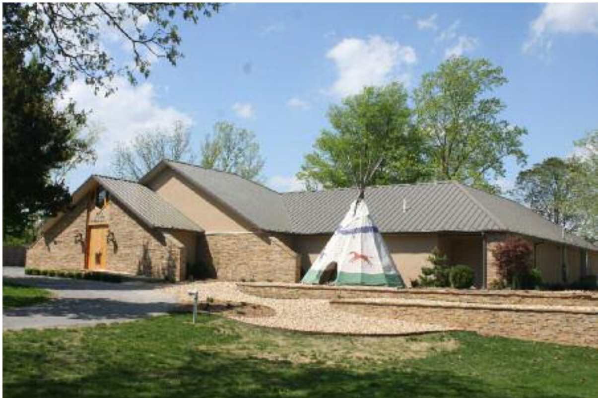
The Museum of Native American History, Bentonville, Arkansas

If the leather robe on which the winter count was inscribed became damaged or worn,